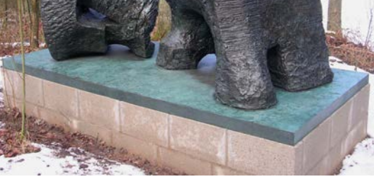
Henry Moore Two-piece reclining figure II