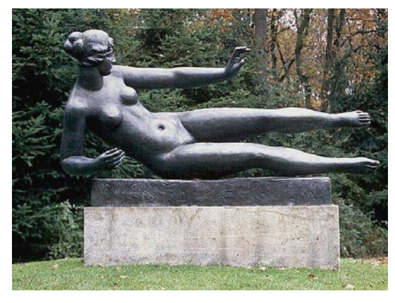
Aristide Maillol l'Air